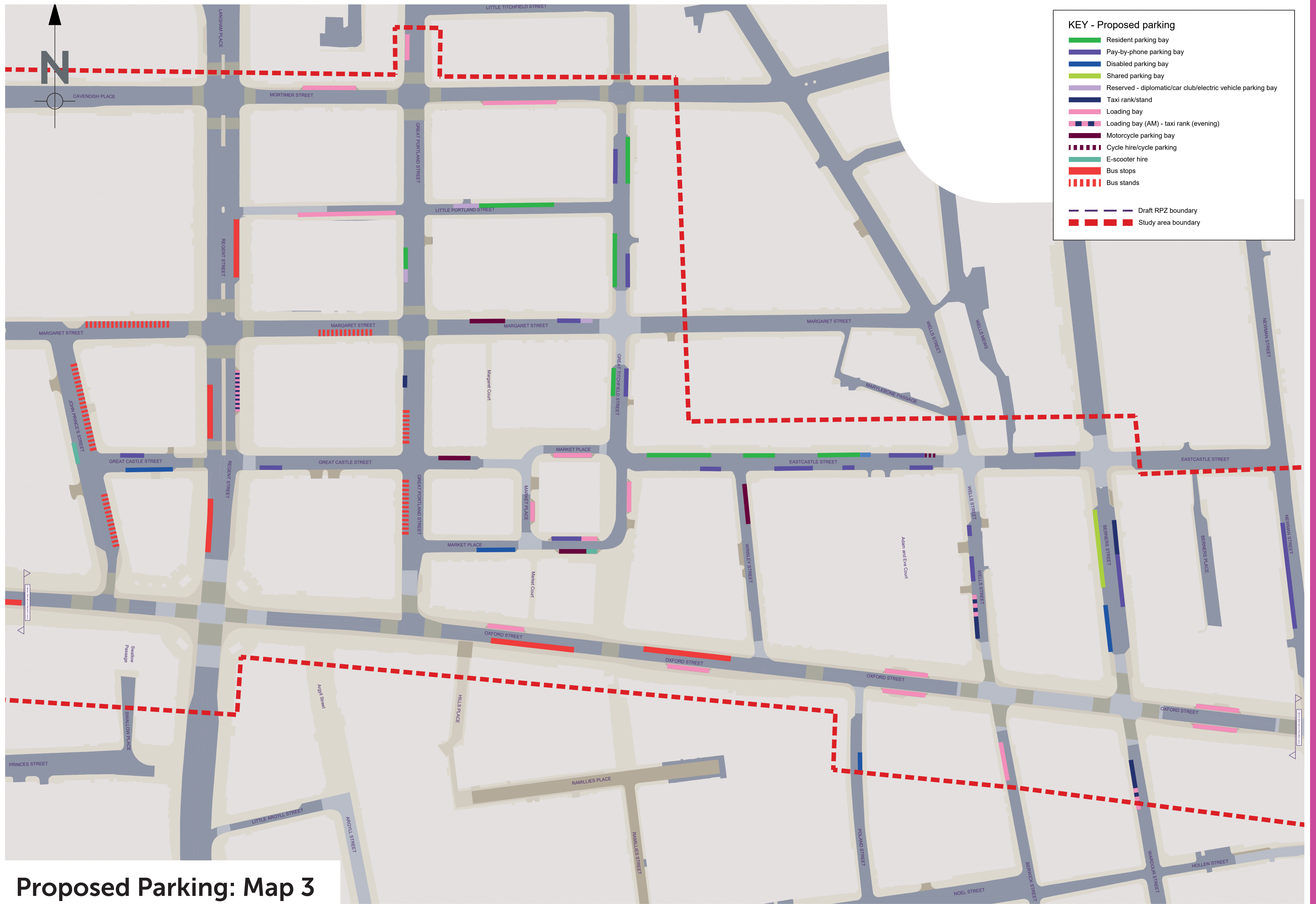
Proposed Parking: Map 3