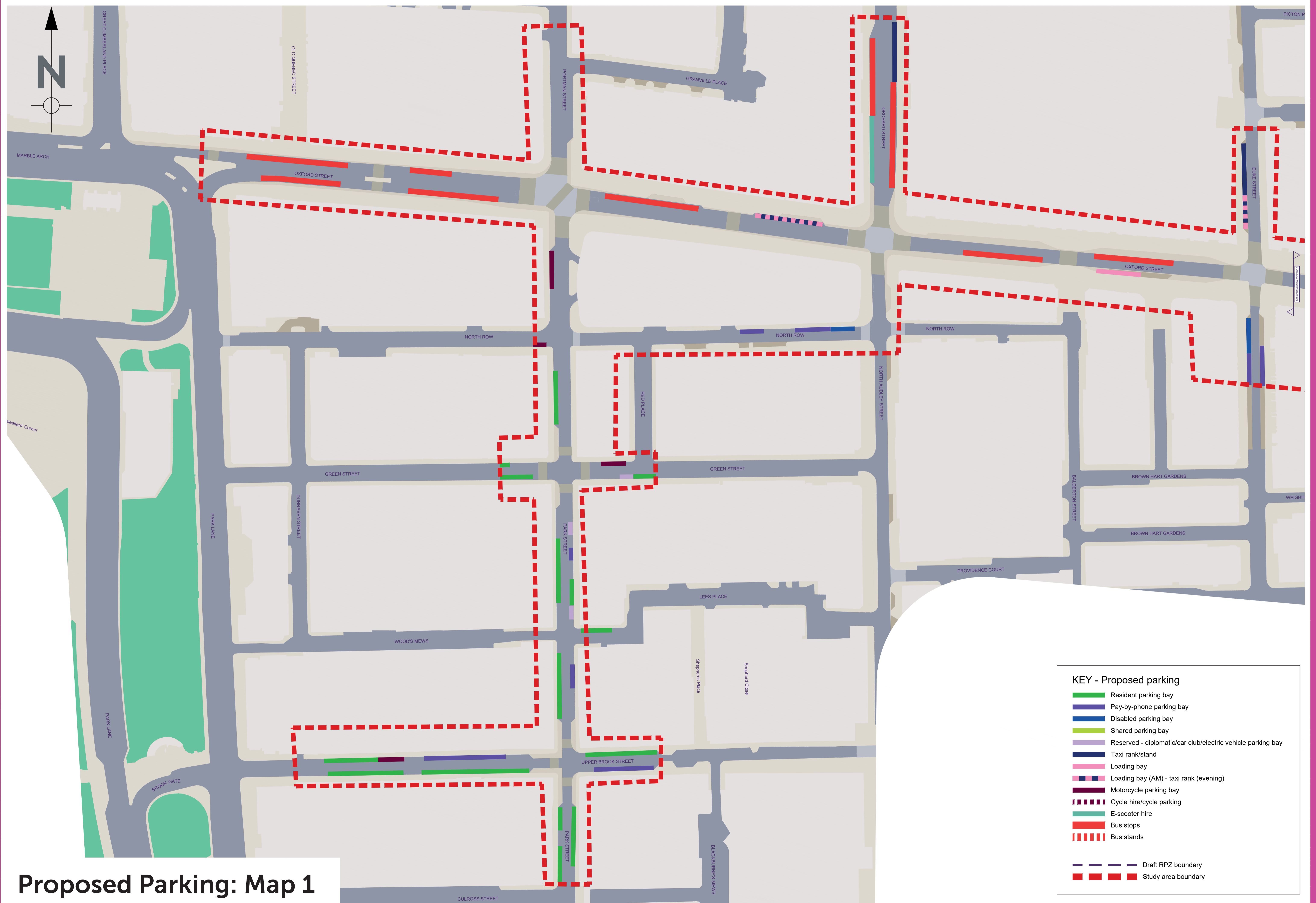
Proposed Parking: Map 1